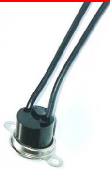
example of use