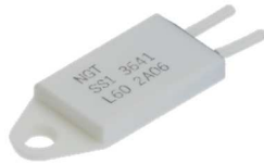
example of use